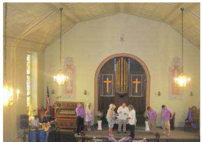
Wedding Ceremony 6/22/2013