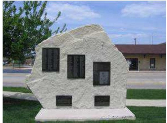
CIVIL WAR MEMORIAL

during the four years of war is not clear, but careful estimates place the number well above 800.