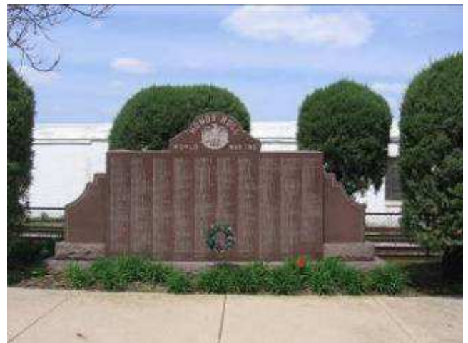
WWII VETERAN MEMORIAL