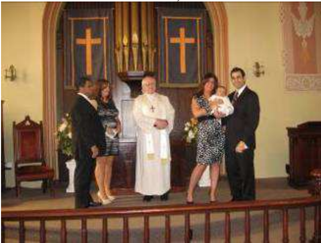
Parents, Minister, Godparents holding little “Rocko”

The Cornerstone newsletter of the Lemont Area Historical Society, a not for profit organization as set forth by the provisions of the State of Illinois. Cornerstone is published six times a year with a circulation of 200 to 300 issues. Issues are mailed to all members of the Lemont Area Historical Society. Complimentary copies are available. Publication offices for Cornerstone are located at 306 Lemont Street, Lemont, IL 60439. The editor may be contact or writing to the Lemont Area Historical Society, P.O. Box 126, Lemont, IL 60439, or leaving a message at the museum at 630-257-2972. Contributions to the newsletter are welcome, although acceptance of copy does not imply that the article will be published. We reserve the right to edit and rewrite to comply with our style. For information about membership in the Lemont Area Historical Society and memorials see the membership application elsewhere in the newsletter.